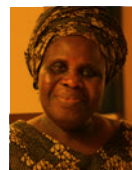
Ama Ata Aidoo (23 March 1942 – 31 May 2023)

We dedicate this year's festival edition to the Ghanaian writer, teacher and politician Ama Ata Aidoo and the Guadeloupean novelist, essayist, playwright, critic, teacher, and thinker Maryse Condé. Both are now loved and dearly missed ancestresses.