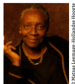
Maryse Condé (11 February 1934 – 2 April 2024)